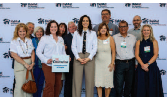
HABITAT FOR HUMANITY: PARTNER OF THE YEAR