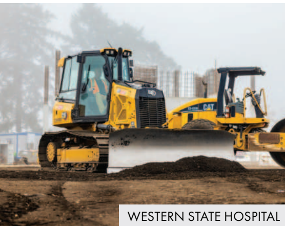
WESTERN STATE HOSPITAL