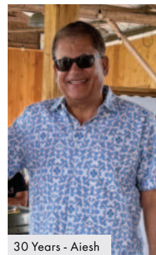
30 Years - Aiesh